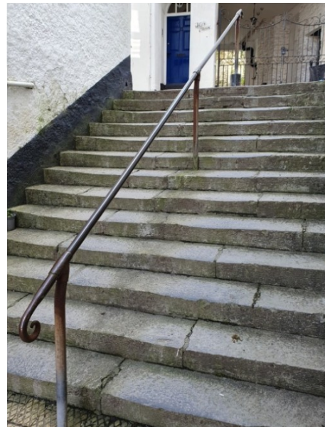
A similar railing in Dartmouth

If it is considered that this is a good way forward, then the project will be costed and residents will be consulted again about whether the Parish Council should progress with the installation.