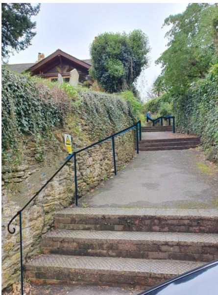
Mock-up of proposal